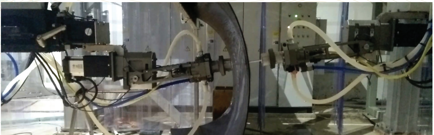
Dual bridge scanner