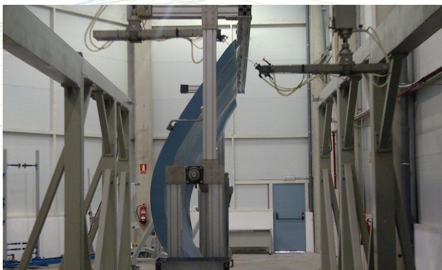
Travelling bridges scanner