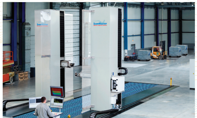
Dual tower scanner