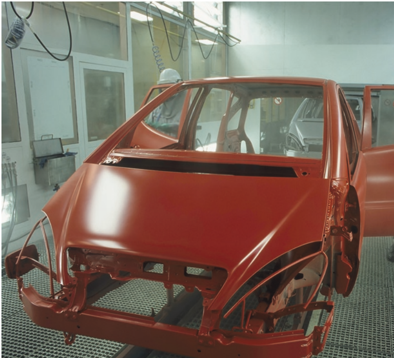
Car body after the painting process