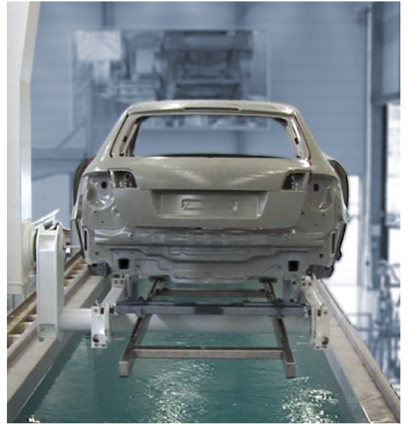
EPD painting process